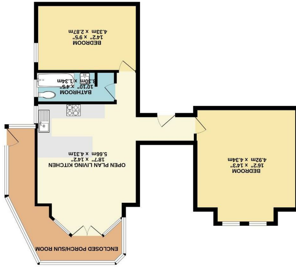
802 sq.ft. (74.5 sq.m.) approx.

Fishwick nor the vendor or lessor accept any responsibility in respect of these particulars, which are not intended to be statements or representations of fact and any intending purchaser or lessee must satisfy himself by inspection or otherwise as to the correctness of each of the statements contained in these particulars. Any floorplans on this brochure are for illustrative purposes only and are not necessarily to scale.